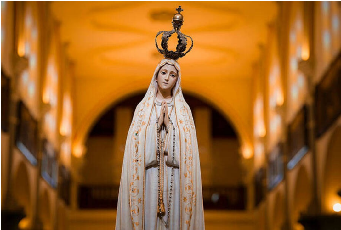
Our Lady of Fatima