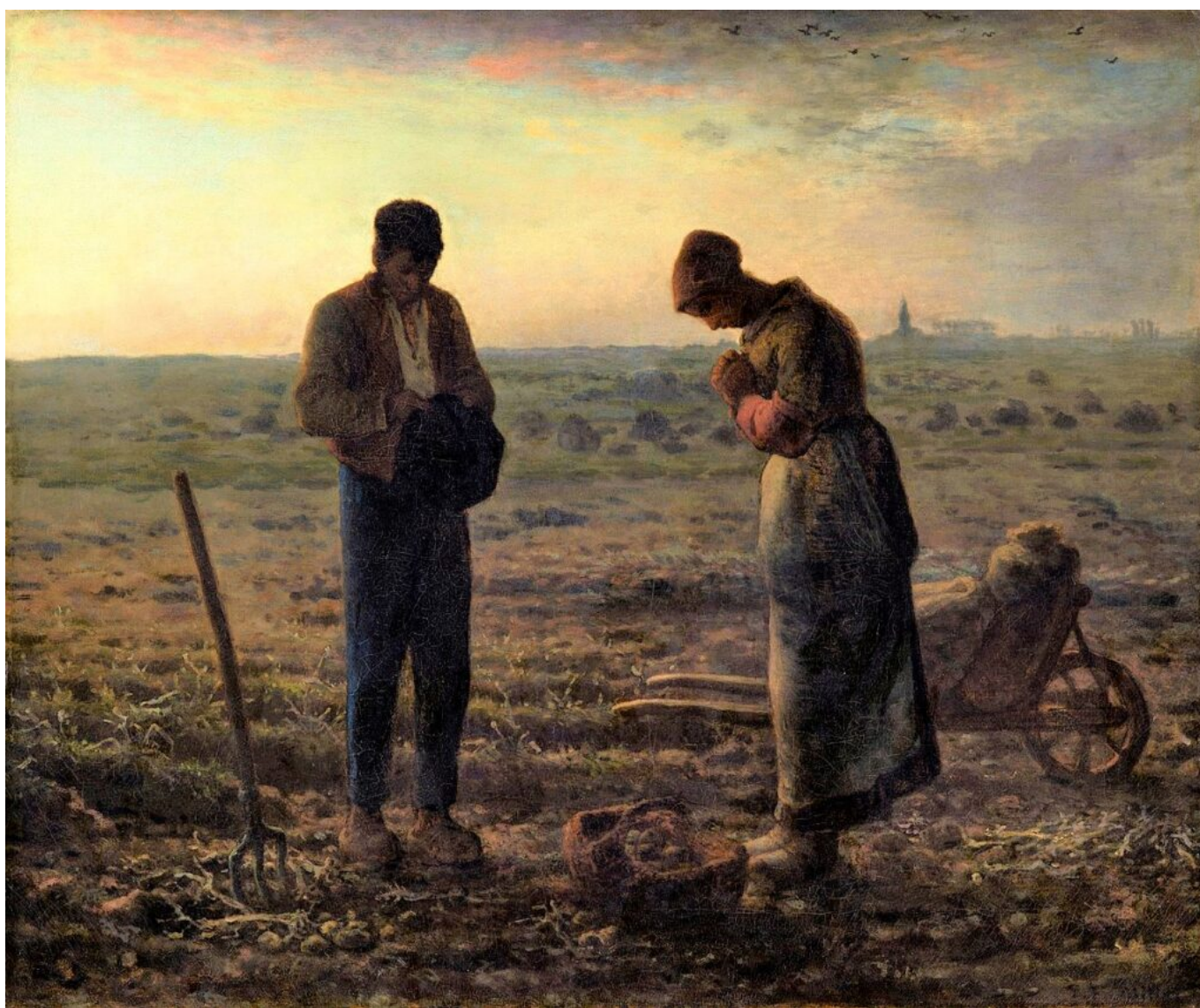
The Angelus by Jean-François Millet

With confidence in God and Our Lady, while distrusting ourselves, we will follow the advice of Padre Pio who said: “Pray, hope, and don’t worry.” We will turn to Saint Michael the Archangel to ‘defend us in battle,’ in our Spiritual Combat, using all of the spiritual weapons at our disposal.