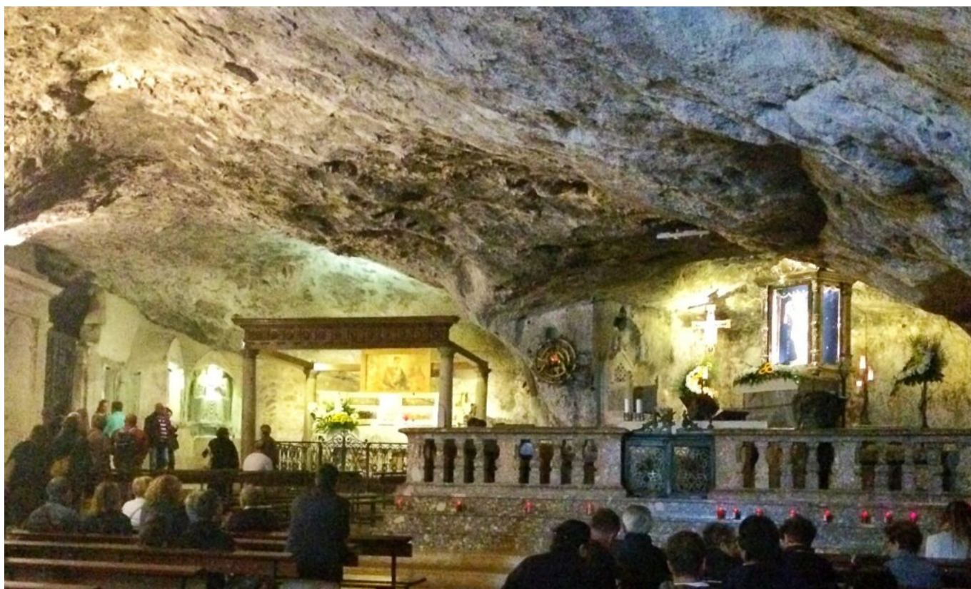
Cave of Saint Michael the Archangel in the Gargano Mountains of Italy