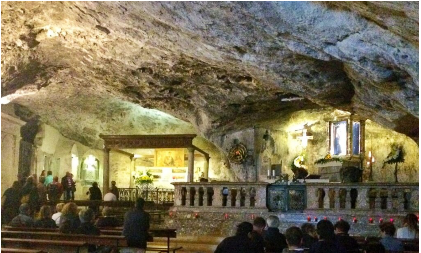
Cave of Saint Michael the Archangel in the Gargano Mountains of Italy