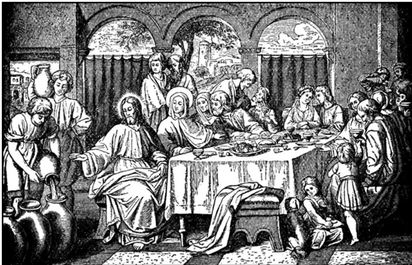
Wedding Feast at Cana

“Suddenly there was with the Angel a multitude of the heavenly army, praising God, and saying: Glory to God in the highest; and on earth peace to men of good will. And it came to pass after the angels departed from them into heaven, the shepherds said to one another, ‘Let us go over to Bethlehem and see this word that is come to pass, which the Lord has hath shewed to us.’ And they came with haste, and they found Mary and Joseph, and the Infant lying in the manger. And seeing, they understood of the word that had been spoken them concerning this Child. And all who had heard marveled at the things told them by the shepherds.” (Luke 2:15-18)