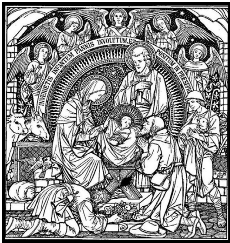
Adoration of the Shepherds

“And it came to pass, in those days, Jesus came from Nazareth of Galilee, and was baptized by John in the Jordan. And forthwith coming up out of the water, he [John] saw the heavens opened, and the Spirit as a dove descending, and remaining on Him. And then there came a voice from Heaven: ‘Thou art My Beloved Son; in Thee I am well pleased.’” (Mark 1:9-11)