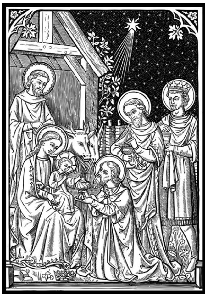
Adoration of the Magi

January 6, 2021, prayerfully, will be a day of Epiphany for the United States of America, when TRUTH will prevail over the darkness of evil. January 6, 2021 will be the traditional Feast of the Epiphany. The Feast of the Epiphany is an ancient holy day in the Catholic Church which celebrates the Divine Revelation of showing forth the TRUTH that Jesus Christ is God Incarnate (a ‘Theophany’). Our Lord and God, Jesus Christ, shines forth in the Epiphany as the Way, the TRUTH and the Light! To be ‘One Nation Under God’ we, as a country, must walk in the Light of TRUTH.