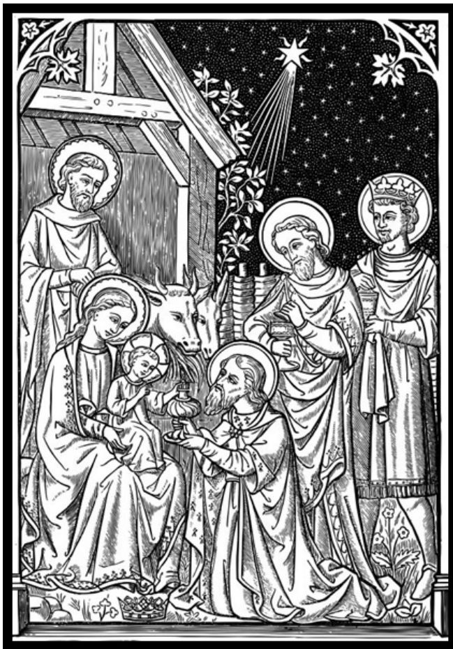
Adoration of the Magi

January 6, 2021, prayerfully, will be a day of Epiphany for the United States of America, when TRUTH will prevail over the darkness of evil. January 6, 2021 will be the traditional Feast of the Epiphany. The Feast of the Epiphany is an ancient holy day in the Catholic Church which celebrates the Divine Revelation of showing forth the TRUTH that Jesus Christ is God Incarnate (a ‘Theophany’). Our Lord and God, Jesus Christ, shines forth in the Epiphany as the Way, the TRUTH and the Light! To be ‘One Nation Under God’ we, as a country, must walk in the Light of TRUTH.