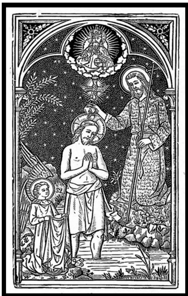
Baptism of Jesus

"... behold the star which they had seen in the east, went before them, until it came and stood over where the Child was. And seeing the star they rejoiced with exceeding great joy. And entering into the house, they found the Child with Mary His Mother, and falling down they adored Him. And opening their treasures, they offered Him gifts: gold, frankincense, and myrrh." (Matt. 2:9-11)