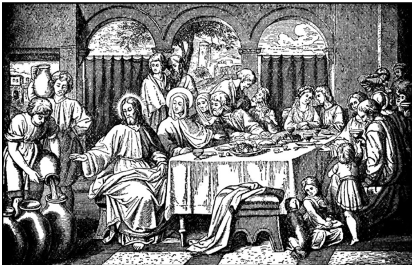
Wedding Feast at Cana

“Suddenly there was with the Angel a multitude of the heavenly army, praising God, and saying: Glory to God in the highest; and on earth peace to men of good will. And it came to pass after the angels departed from them into heaven, the shepherds said to one another, ‘Let us go over to Bethlehem and see this word that is come to pass, which the Lord has hath shewed to us.’ And they came with haste, and they found Mary and Joseph, and the Infant lying in the manger. And seeing, they understood of the word that had been spoken them concerning this Child. And all who had heard marveled at the things told them by the shepherds.” (Luke 2:15-18)