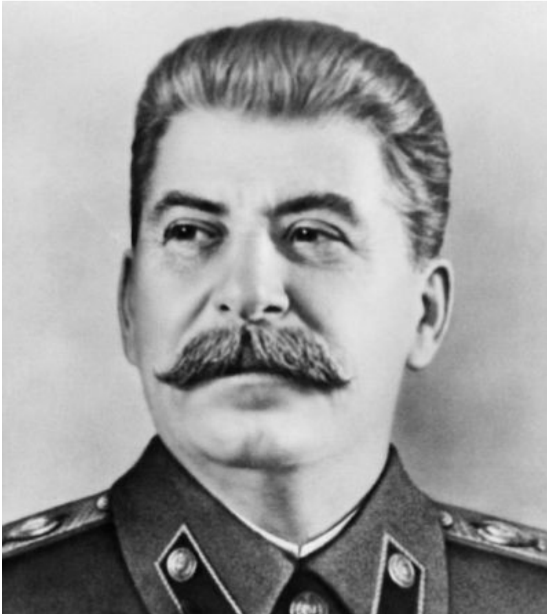
Joseph Stalin (1878-1953)

Stalin was the General Secretary of the Communist Party of the Soviet Union from 1922 to 1952. The Soviet Union or USSR is also known as the 'Union of Soviet Socialist Republics.' His reign of terror gives us insight into what it is to live under Socialism and/or Communism.