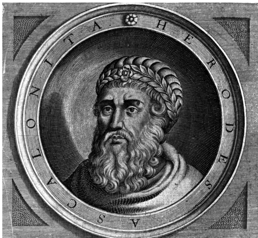
King Herod 'the Great'

After the Birth of our Lord and God, Jesus Christ, an angel of the Lord appeared in a dream to Good Saint Joseph, saying: “Arise and take the Child and His Mother, and fly into Egypt: and be there until I shall tell thee. For it will come to pass that Herod will seek the Child to destroy Him” (Matt. 2:13).