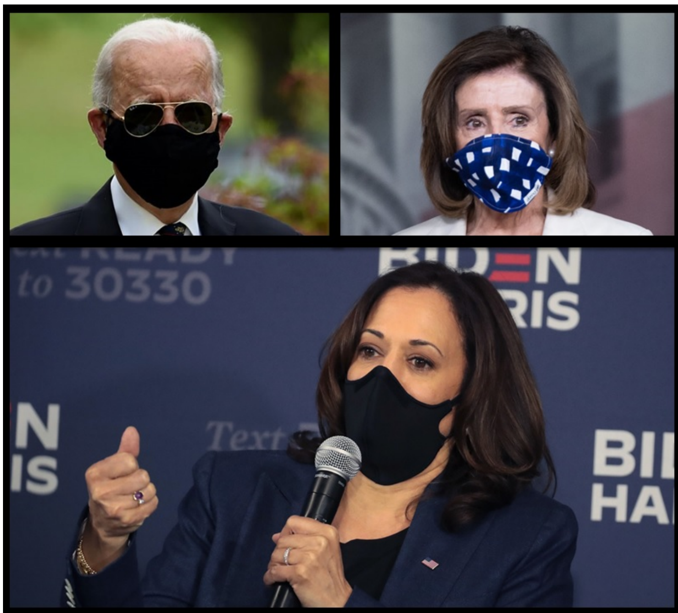
Clockwise from top-left: Joe Biden, Nancy Pelosi, and Kamala Harris

The role model of the Democratic Party leaders seems to be King Herod. Calling to mind the despicable Herod, who tried to deceive the Wise Men by asking that they inform him when they found the Christ, so that he too could 'adore' Him, we have the duplicitous Democratic Party Leaders of today who support the ongoing abortion holocaust under the guise of "protecting and advancing reproductive health, rights, and justice." The Democratic Party Platform embraces the intrinsic evil of abortion up to birth, while demanding that all Americans fund such wicked plans for the murder of the unborn through their tax dollars. This is demonic. This is DEMONcratic.