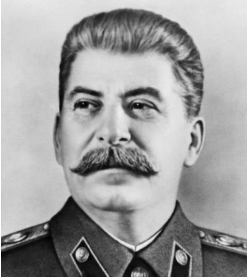
Joseph Stalin (1878-1953)

Stalin was the General Secretary of the Communist Party of the Soviet Union from 1922 to 1952. The Soviet Union or USSR is also known as the 'Union of Soviet Socialist Republics.' His reign of terror gives us insight into what it is to live under Socialism and/or Communism.