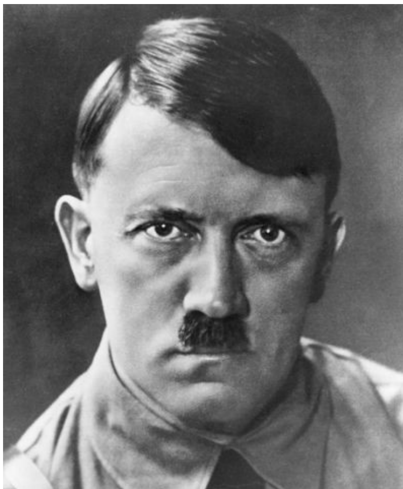
Adolf Hitler (1889-1945)