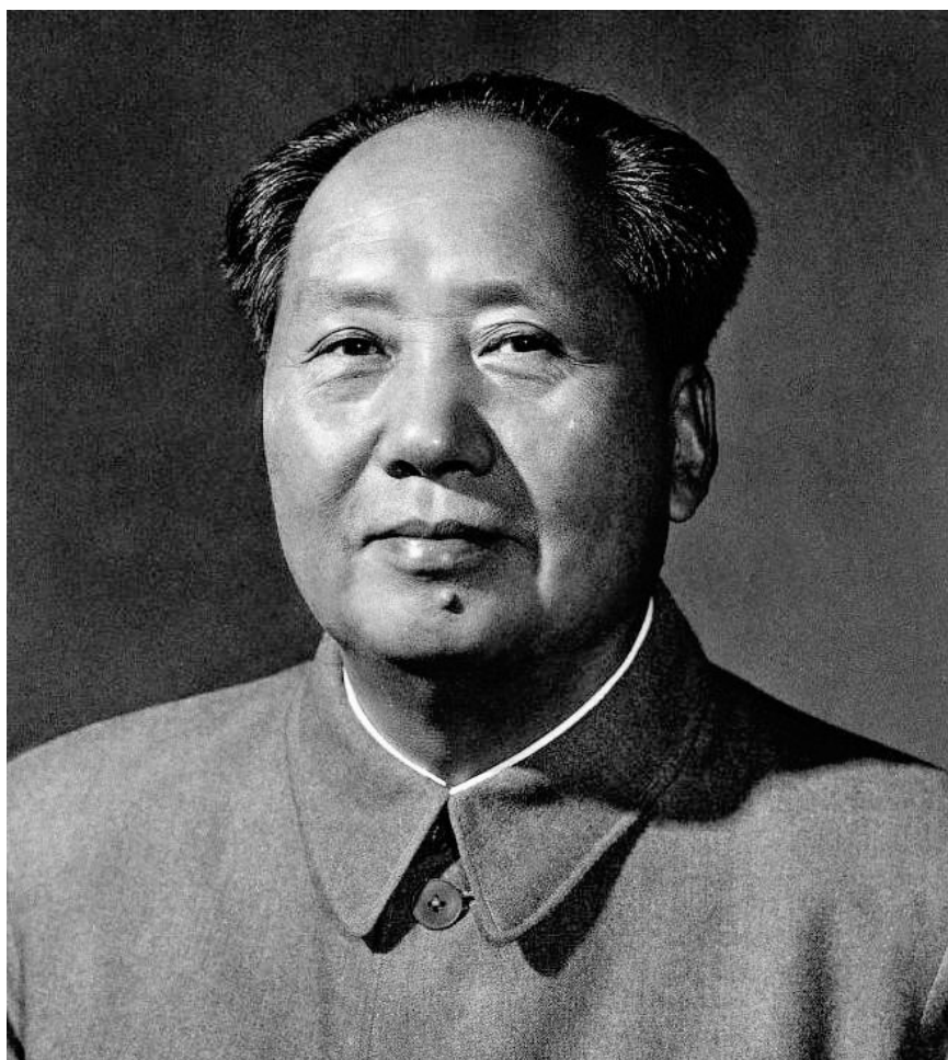
Mao Zedong (1893-1976)

Mao Zedong was the Chairman of the Communist Party of China from 1943 to 1976. The holocausts that took place during Mao's savage reign of terror total 77.5 million , including the following: