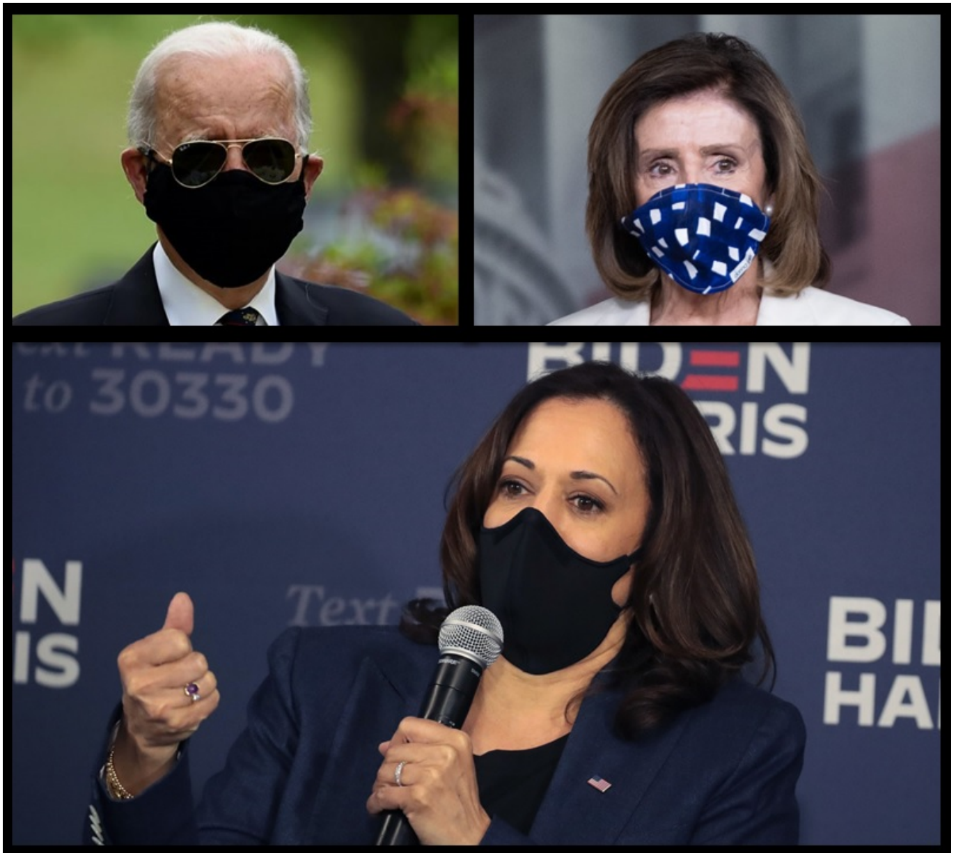
Clockwise from top-left: Joe Biden, Nancy Pelosi, and Kamala Harris

The role model of the Democratic Party leaders seems to be King Herod. Calling to mind the despicable Herod, who tried to deceive the Wise Men by asking that they inform him when they found the Christ, so that he too could 'adore' Him, we have the duplicitous Democratic Party Leaders of today who support the ongoing abortion holocaust under the guise of "protecting and advancing reproductive health, rights, and justice." The Democratic Party Platform embraces the intrinsic evil of abortion up to birth, while demanding that all Americans fund such wicked plans for the murder of the unborn through their tax dollars. This is demonic. This is DEMONcratic.