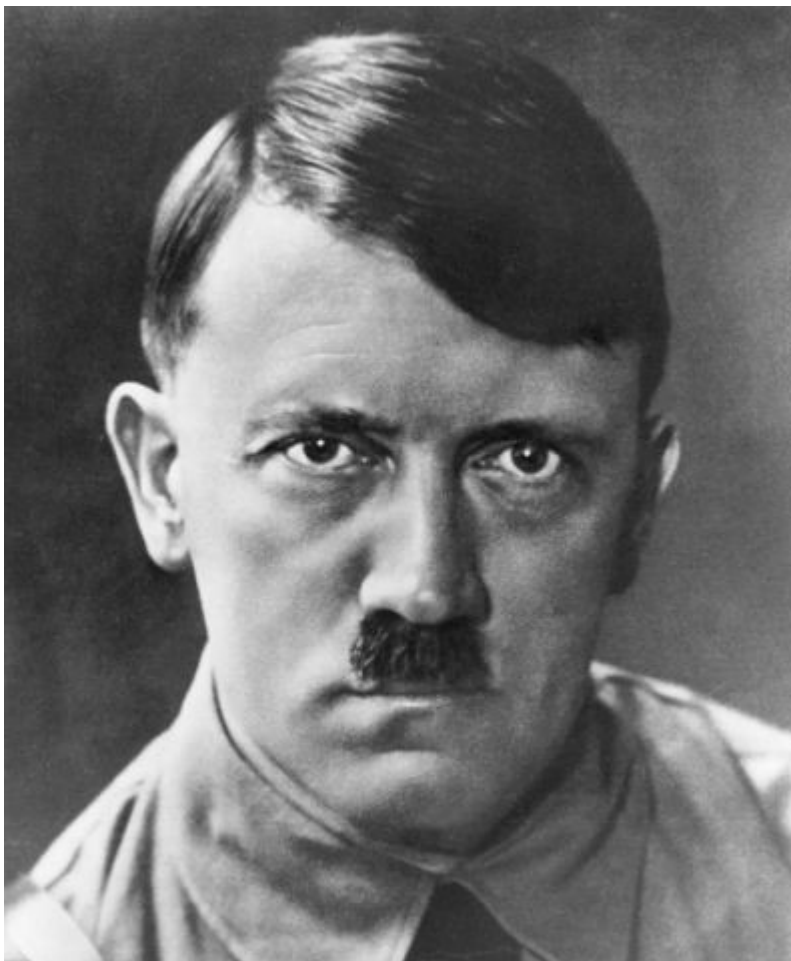
Adolf Hitler (1889-1945)