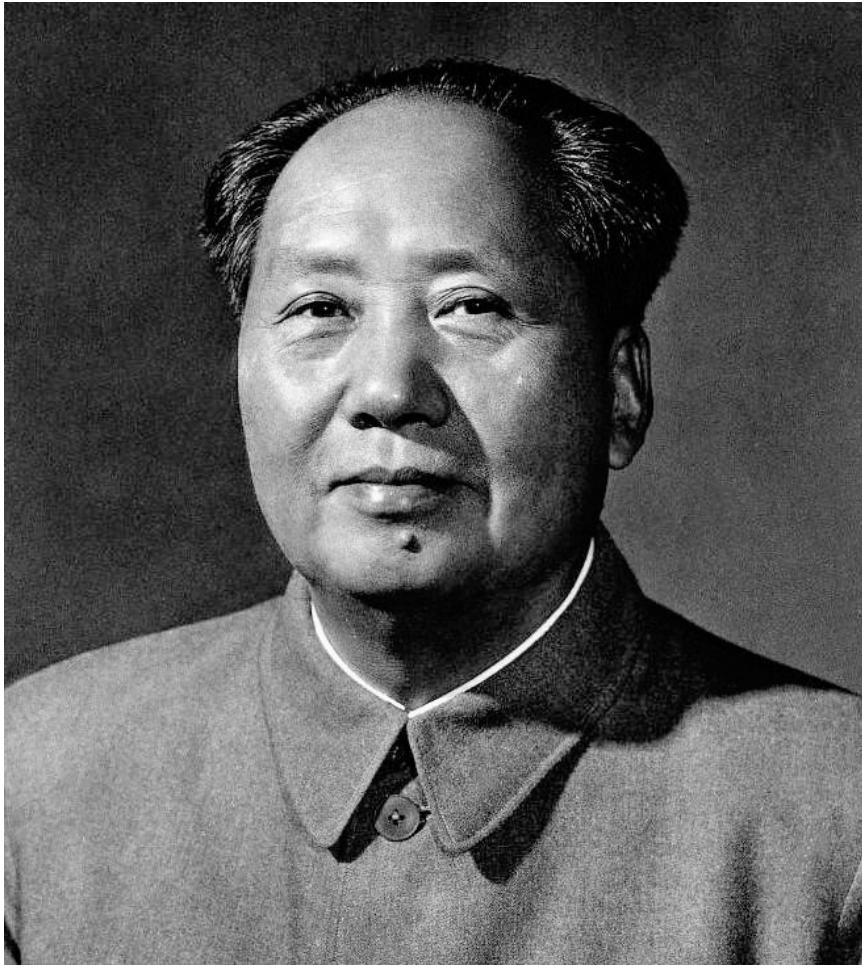
Mao Zedong (1893-1976)

Mao Zedong was the Chairman of the Communist Party of China from 1943 to 1976. The holocausts that took place during Mao's savage reign of terror total 77.5 million , including the following: