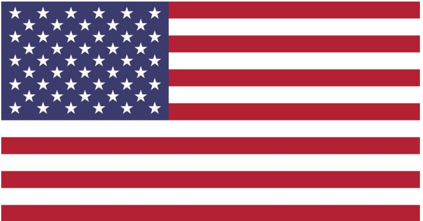
The American Flag

As Catholics, we must reject the red flags of Socialism and Communism. The failed Godless ideologies of Socialism and Communism have been and will continue to be a sure path to human misery and to the fires of hell. We must love God and country and stand up united against any demonic holocausts in our land. To this end, we fervently can recite the Pledge of Allegiance.