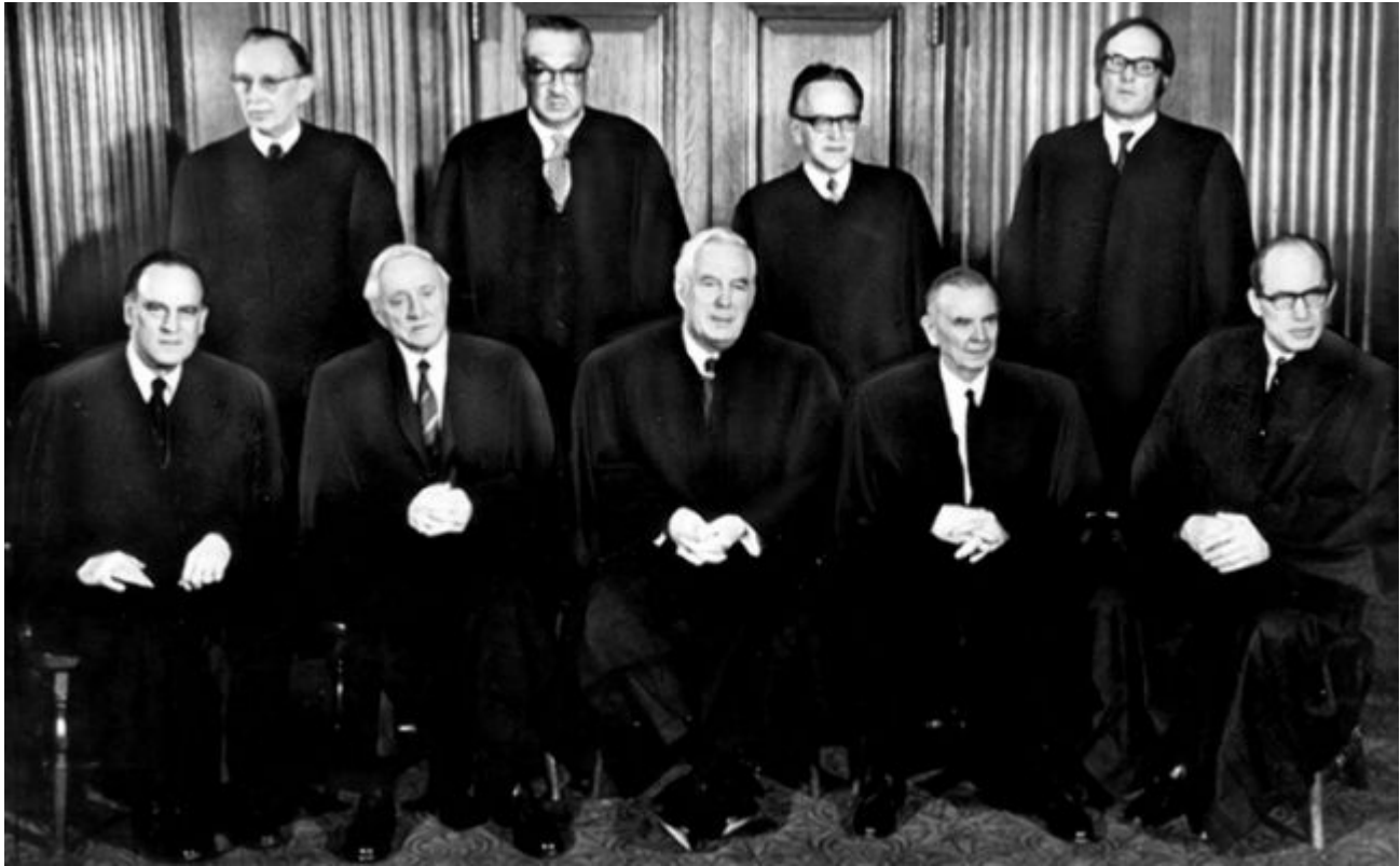
The Supreme Court of the United States, 1973

The 'Faces of Evil' in the above group photo of the United States Supreme Court of 1973, who murderously ruled in favor of legalizing abortion, include the majority of Chief Justice Warren E. Burger and the following Associate Justices: Harry Blackmun, William O. Douglas, William J. Brennan Jr, Potter Stewart, Thurgood Marshall, and Lewis Powell Jr. The only two to dissent were Associate Justices Byron White and William Rehnquist. The date of this ruling, which will live in infamy, was January 22, 1973.