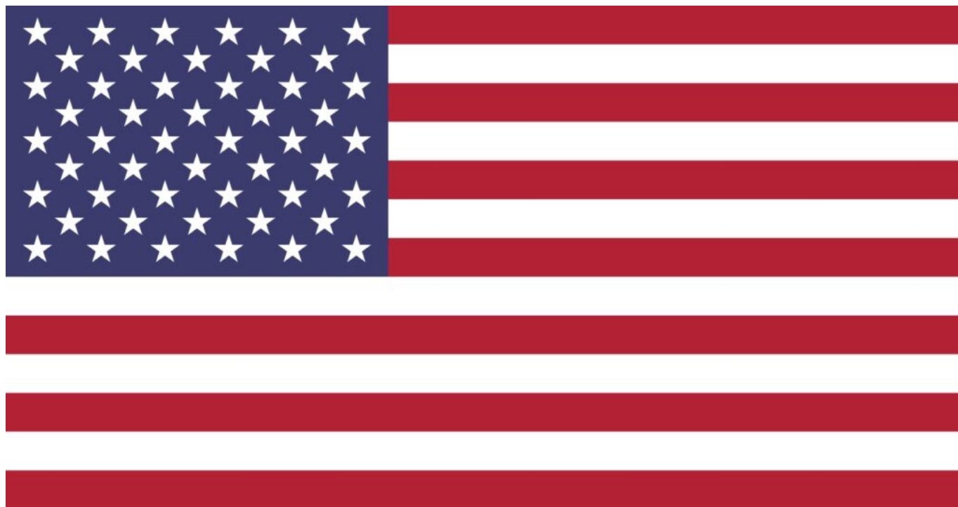
The American Flag

As Catholics, we must reject the red flags of Socialism and Communism. The failed Godless ideologies of Socialism and Communism have been and will continue to be a sure path to human misery and to the fires of hell. We must love God and country and stand up united against any demonic holocausts in our land. To this end, we fervently can recite the Pledge of Allegiance.