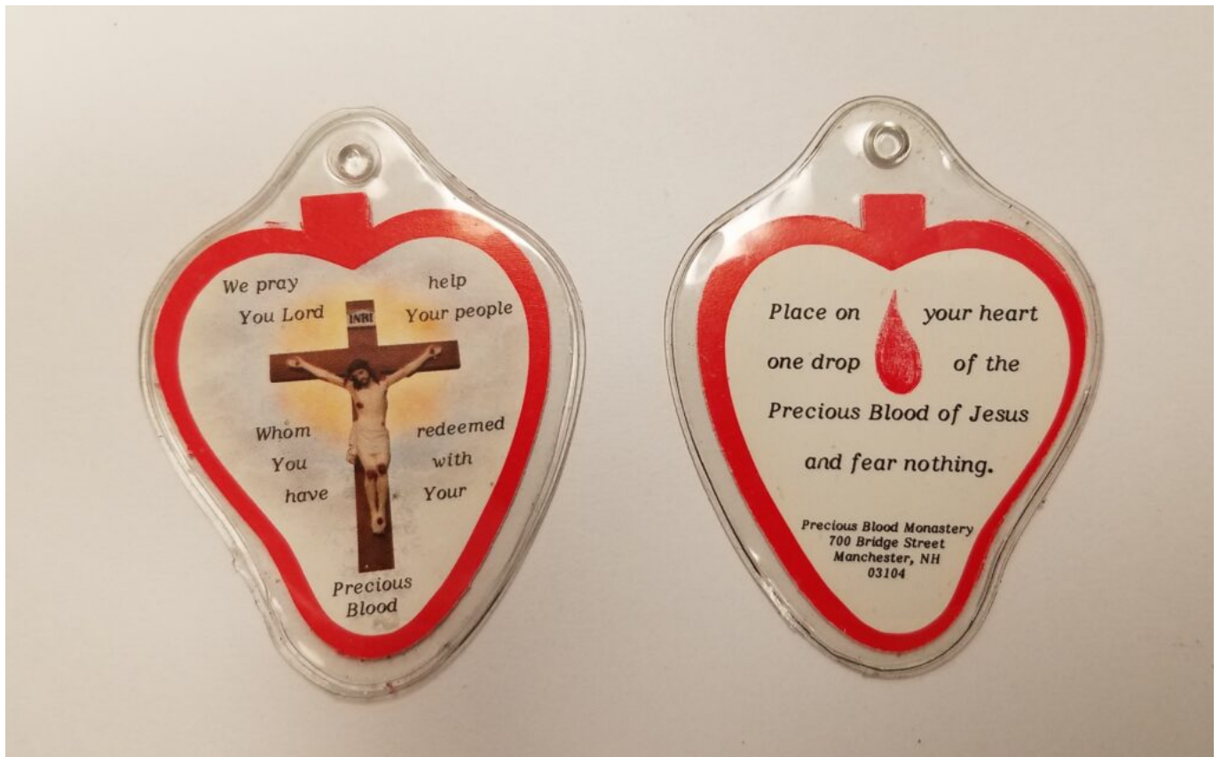
Precious Blood of Jesus Badge