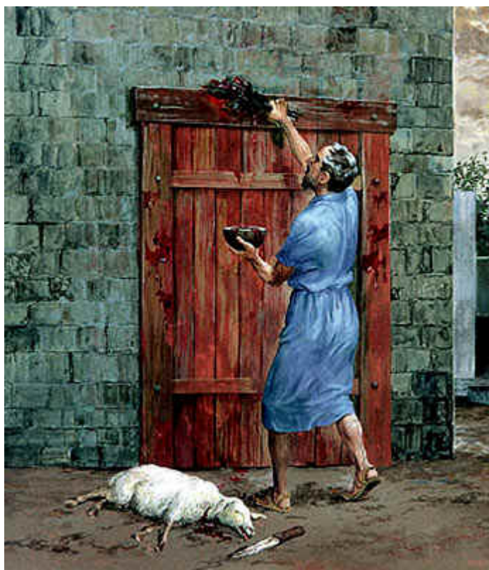
The Passover (see Exodus 12)

The lambs which were sacrificed and shed their blood during the Exodus became known as the Passover lambs. On Good Friday on Calvary, our Lord and God Jesus Christ became our Passover Lamb – the Sacrificial Lamb of God Who would take away the sins of the world. As the Hebrew people were delivered from the slavery of Egypt by the blood of a lamb, we are delivered out of slavery to sin and death by the Precious Blood of Jesus Christ shed for us on Calvary, which is re-presented for us at each and every Holy Sacrifice of the Mass. The Precious Blood of Jesus protected St. Clare of Assisi and her convent from an advancing horde of Islamic Saracens. As the Muslims approached, she prayed: “We beseech Thee, O Lord, help Thy servants whom Thou hast redeemed with Thy Precious Blood.” The convent was then saved. With this in mind, we all must trust in the Precious Blood of Christ and be not afraid in the face of the evil horde of Marxist revolutionaries in our time. Precious Blood of Jesus save our country! Precious Blood of Jesus save the world! Precious Blood of Jesus save the Church!