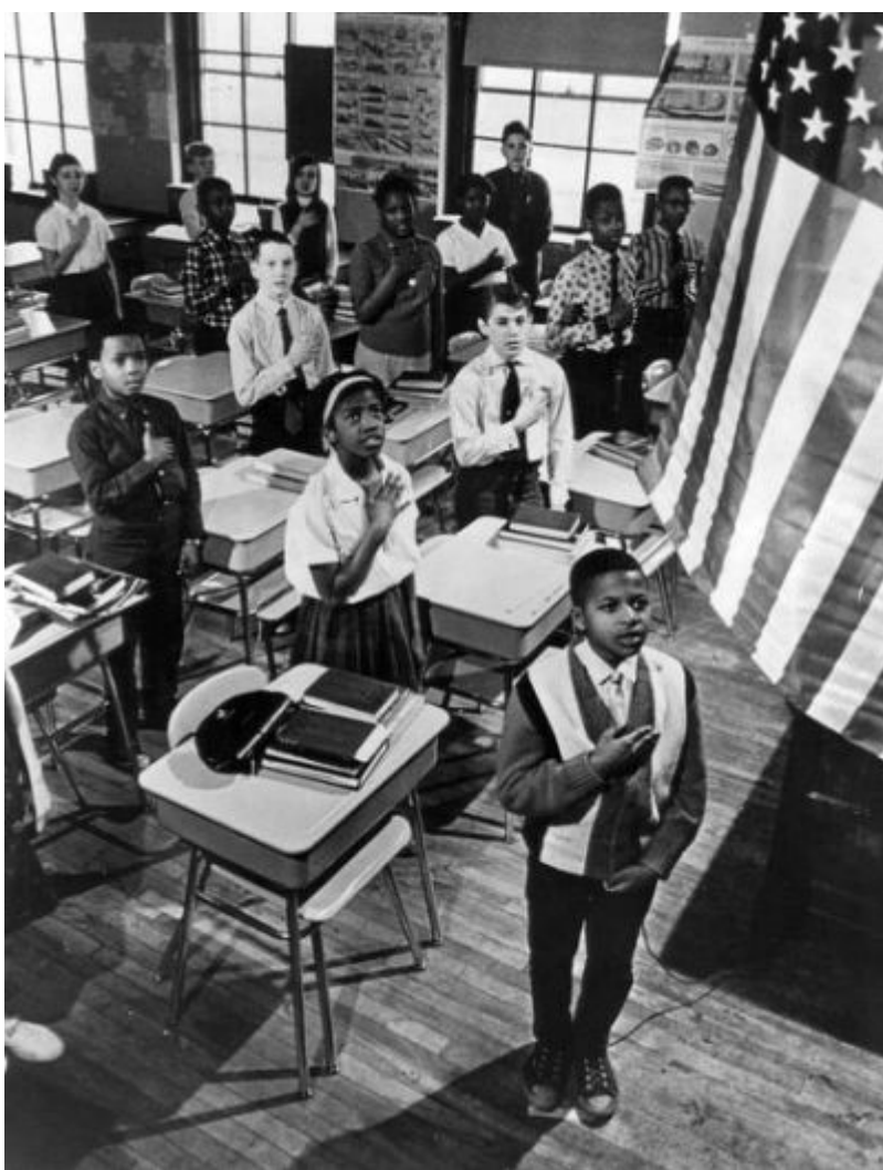
Students stand to recite the Pledge of Allegiance

As we recall the birth of our country on the Fourth of July, as Americans and as Catholics, it has been our tradition to stand and place our right hands over our hearts and recite the Pledge of Allegiance to the Flag of the United States of America. We recall those revered words, "One Nation under God." Also in July, we take note that the Church has traditionally dedicated this entire month to the Most Precious Blood of our Lord and God, Jesus Christ. As Catholics and Americans, we love God and country. However, not everyone living in America shares that love.