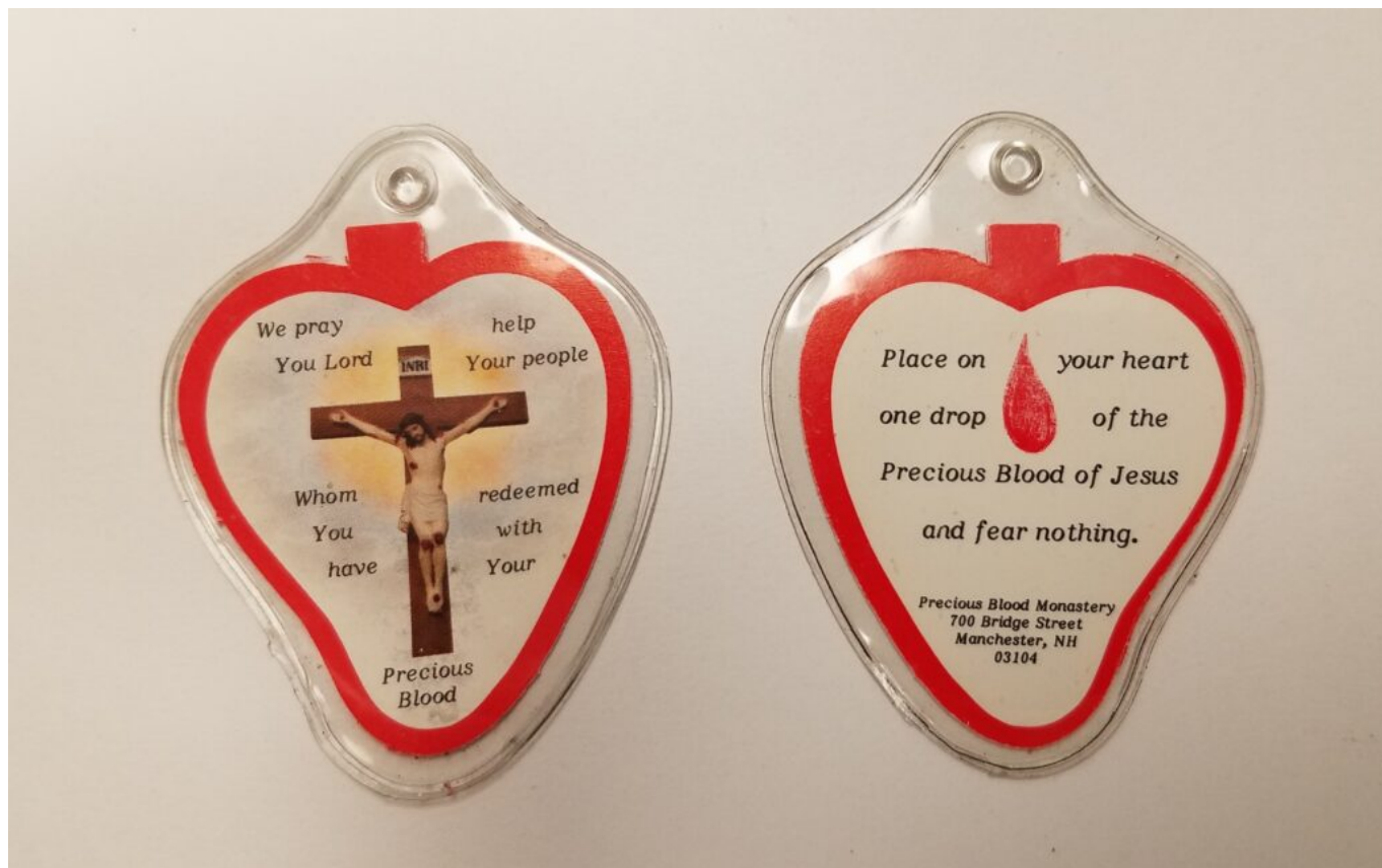
Precious Blood of Jesus Badge