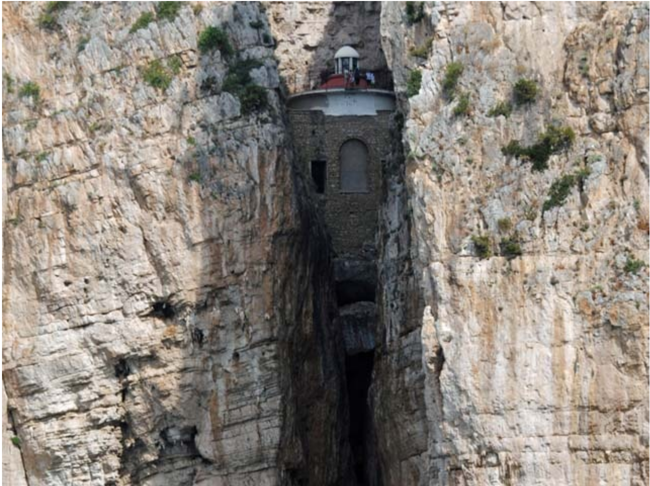
Chapel of the Crucifix at Split Mountain

This Holy Pontiff, Pope Pius IX, spent much of his time at Gaeta praying before a bloody Miraculous Crucifix, at the Sanctuary of Split Mountain . The Chapel of the Crucifix at Split Mountain is located on a huge rock, which is wedged deep within a fissure running through the mountain that is said to have been formed at the moment that Our Lord Jesus Christ died on Calvary. It is said that this 2,000-year-old fault line, crafted by the Hand of God, extends from Jerusalem, where drops of Our Lord's Precious Blood fell to the ground at Calvary, to the western end of Europe—upon which numerous churches have been built along the way as memorials to Our Lord's salvific Death on the Cross.