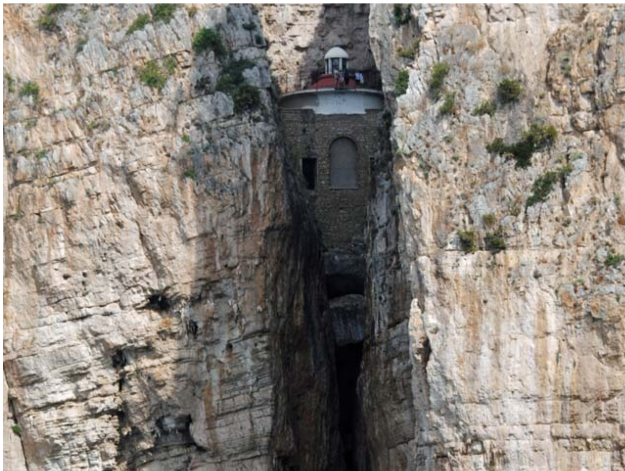
Chapel of the Crucifix at Split Mountain

This Holy Pontiff, Pope Pius IX, spent much of his time at Gaeta praying before a bloody Miraculous Crucifix, at the Sanctuary of Split Mountain . The Chapel of the Crucifix at Split Mountain is located on a huge rock, which is wedged deep within a fissure running through the mountain that is said to have been formed at the moment that Our Lord Jesus Christ died on Calvary. It is said that this 2,000-year-old fault line, crafted by the Hand of God, extends from Jerusalem, where drops of Our Lord's Precious Blood fell to the ground at Calvary, to the western end of Europe—upon which numerous churches have been built along the way as memorials to Our Lord's salvific Death on the Cross.