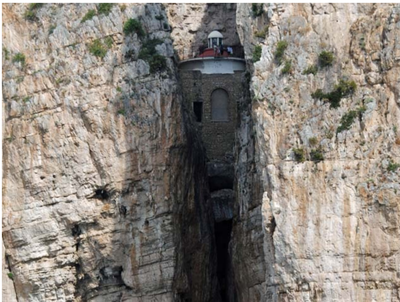
Chapel of the Crucifix at Split Mountain

This Holy Pontiff, Pope Pius IX, spent much of his time at Gaeta praying before a bloody Miraculous Crucifix, at the Sanctuary of Split Mountain . The Chapel of the Crucifix at Split Mountain is located on a huge rock, which is wedged deep within a fissure running through the mountain that is said to have been formed at the moment that Our Lord Jesus Christ died on Calvary. It is said that this 2,000-year-old fault line, crafted by the Hand of God, extends from Jerusalem, where drops of Our Lord's Precious Blood fell to the ground at Calvary, to the western end of Europe—upon which numerous churches have been built along the way as memorials to Our Lord's salvific Death on the Cross.