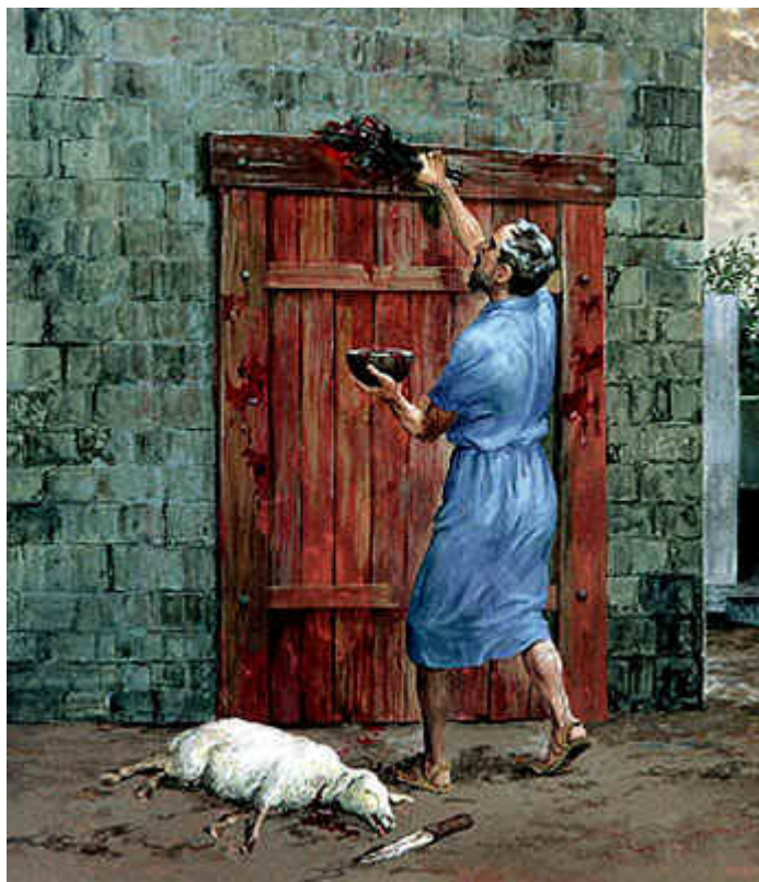
The Passover (see Exodus 12)

The lambs which were sacrificed and shed their blood during the Exodus became known as the Passover lambs. On Good Friday on Calvary, our Lord and God Jesus Christ became our Passover Lamb – the Sacrificial Lamb of God Who would take away the sins of the world. As the Hebrew people were delivered from the slavery of Egypt by the blood of a lamb, we are delivered out of slavery to sin and death by the Precious Blood of Jesus Christ shed for us on Calvary, which is re-presented for us at each and every Holy Sacrifice of the Mass. The Precious Blood of Jesus protected St. Clare of Assisi and her convent from an advancing horde of Islamic Saracens. As the Muslims approached, she prayed: “We beseech Thee, O Lord, help Thy servants whom Thou hast redeemed with Thy Precious Blood.” The convent was then saved. With this in mind, we all must trust in the Precious Blood of Christ and be not afraid in the face of the evil horde of Marxist revolutionaries in our time. Precious Blood of Jesus save our country! Precious Blood of Jesus save the world! Precious Blood of Jesus save the Church!