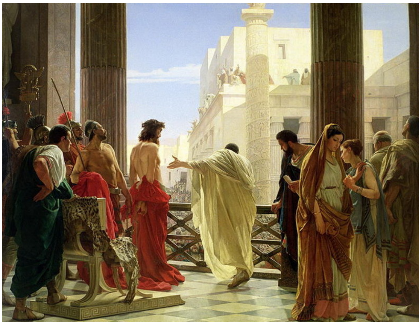
Ecce Homo by Antonio Ciseri (c. 1871)

When Jesus was before Pontius Pilate, the enemies of God assembled a mob to stage a ‘rigged election.’ When Pilate asked the frenzied assembly whether Jesus or Barabbas should be released, the chief priests had instructed the organized rabble of that time to cry out Barabbas’ name. “But the chief priests and ancients persuaded the people, that they should ask for Barabbas, and take Jesus away” (Matt. 27:20). When Pilate asked what he should do with Jesus, they were trained to shout in unison: “Let Him be crucified!” (Matt. 27:22). This was the first recorded ‘public opinion poll’ and it was ‘fixed’ to yield an evil result. Pilate declared, “I am innocent of the Blood of this just Man” (Matt. 27:24). But with great hatred towards Jesus Christ, the Divine Son of God, prompted by the evil ‘community organizers’ of their time, the crowd demonically shouted out in unison: “His Blood be upon us and our children” (Matt. 27:25).