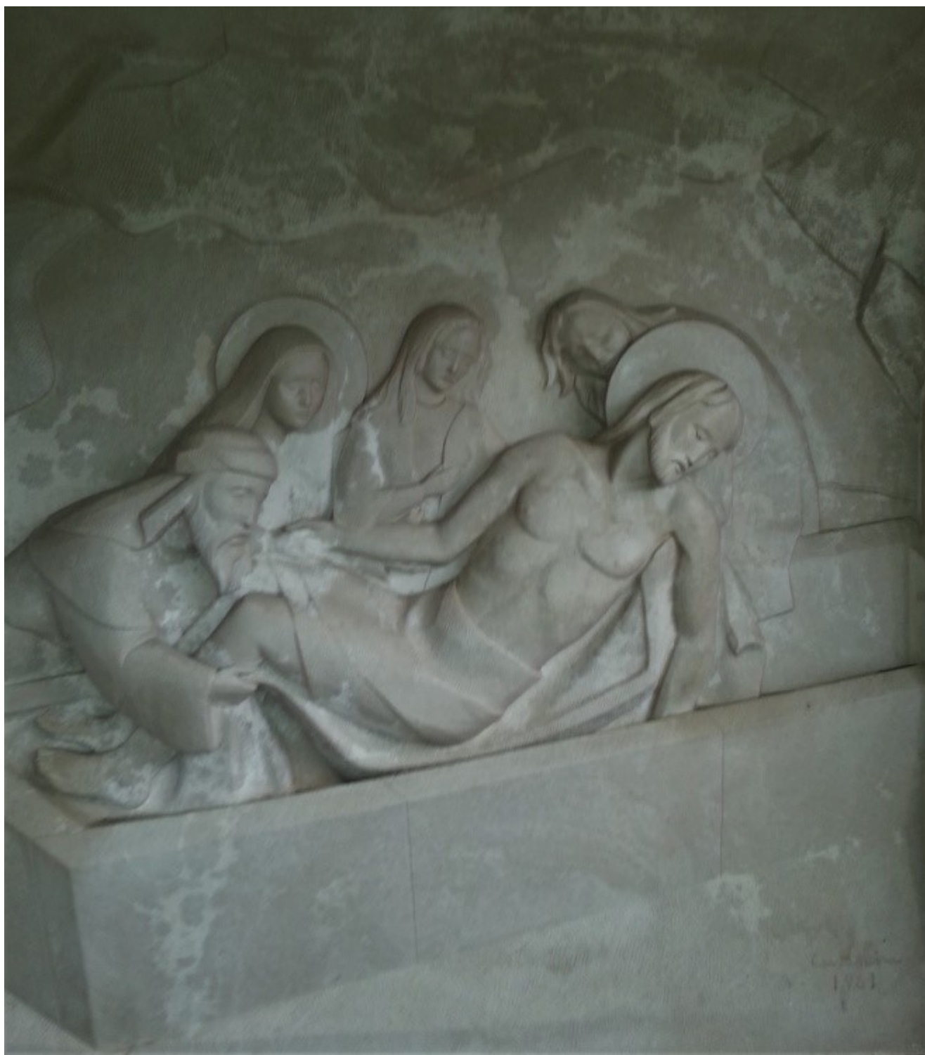
14th Station: JESUS IS PLACED IN THE SEPULCHER