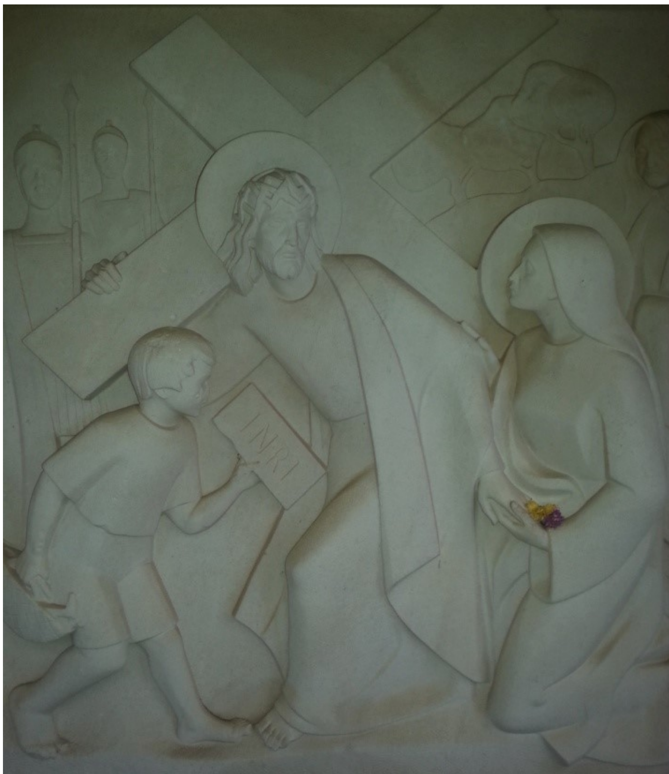
4th Station: JESUS MEETS HIS AFFLICTED MOTHER